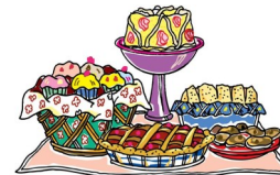
YOUTH BAKE SALE