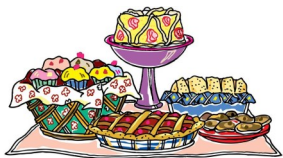
YOUTH BAKE SALE